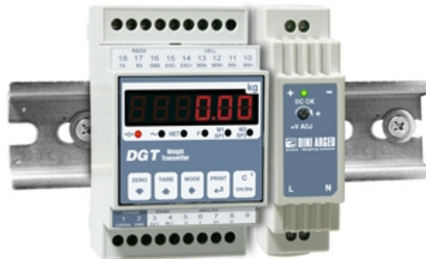
DGT1 with DR1512 optional power supply, for DIN bar