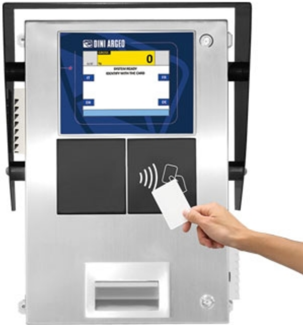
3590EGTBOX8: with RFID card reader.