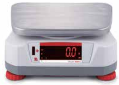
Rear Display with Integrated Touchless Sensor