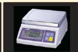
Stainless steel platter ▲