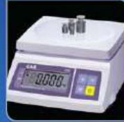
Dual interval technology