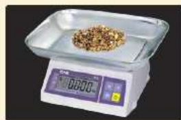
Fish tray ▲